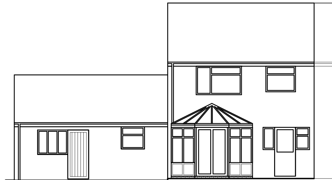
REAR ELEVATION AS PROPOSED (1:100)