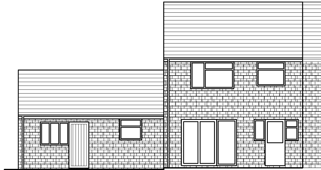
REAR ELEVATION AS EXISTING (1:100)