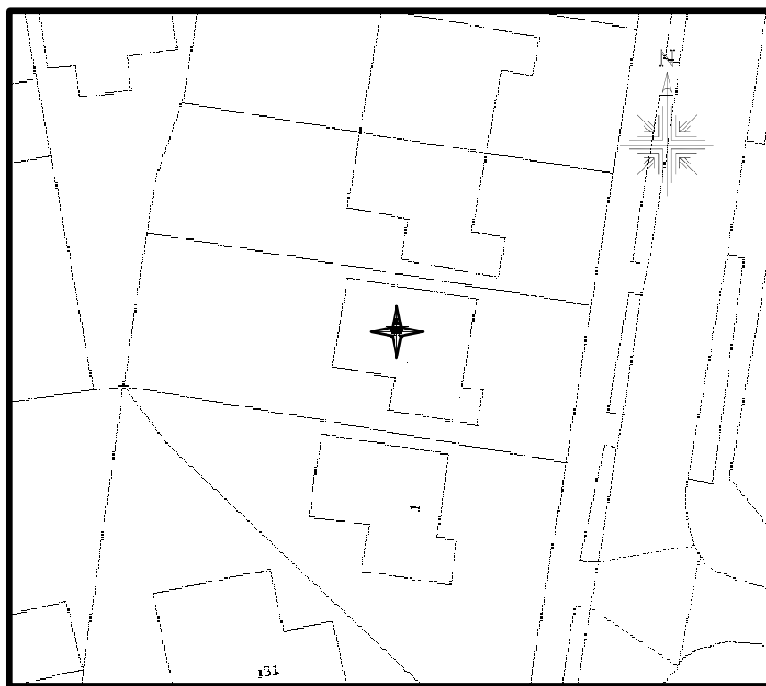
PLAN VIEW (1:500)