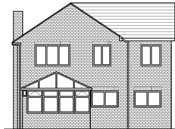
REAR ELEVATION AS PROPOSED (1:100)